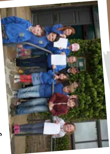
Visiting the Council Chambers for the debate.

was presented with a selection of letters from the class asking that Orkney should become one of the Local Authorities in Scotland who banned the release of sky lanterns and helium balloons.