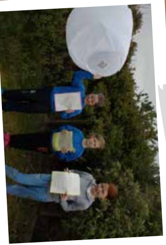
Sky lanterns like this kill and injure marine and terrestrial wildlife.

MCS would like to thank the teachers and students at Hope Community School for the amazing work they have done to get a sky lantern and helium balloon release ban in their local area, and for sharing their inspiring story with us.